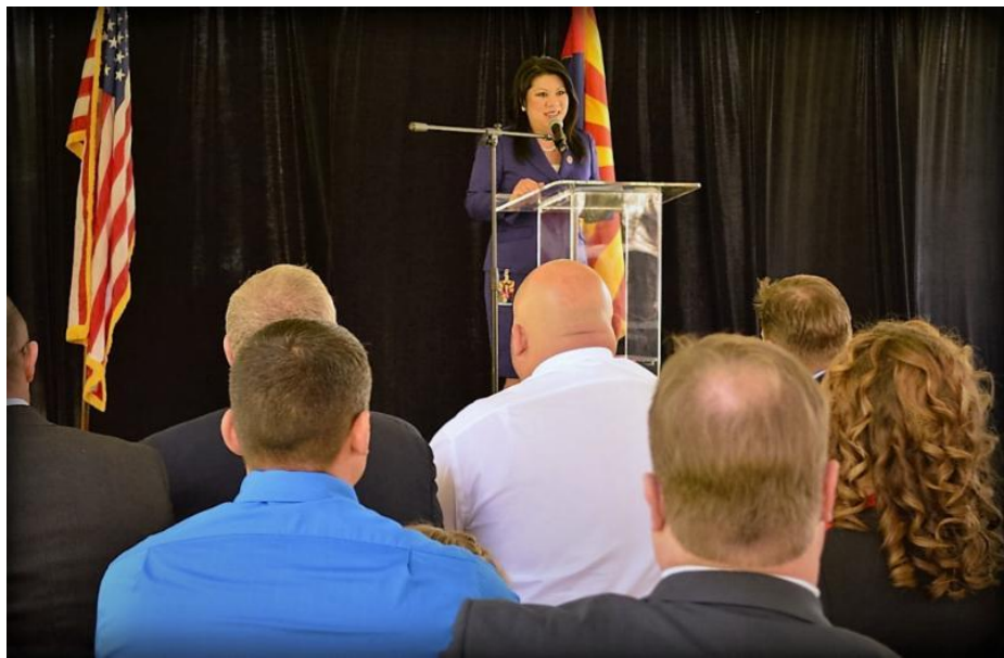
Arizona State Senator Kimberly Yee

The day started off with opening remarks by Arizona State Senator Kimberly Yee. Senator Yee applauded the ICA for focusing their collaborative process of working alongside businesses to increase safety through the Voluntary Protection Program (VPP). VPP sets performance-based criteria for a managed safety and health system, invites sites to apply, and then assesses applicants against these criteria.